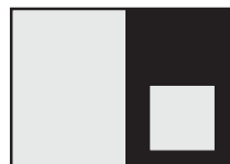
Layout B-2 Partial Bleed Main Photo 1 Insert Photo