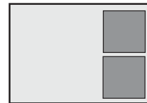
Layout A-3 Full Bleed Main Photo 2 Insert photos