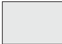
Layout A-1 Full Bleed Main Photo