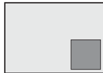
Layout A-2 Full Bleed Main Photo 1 Insert Photo