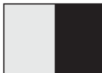
Layout B-1 Partial Bleed Main Photo